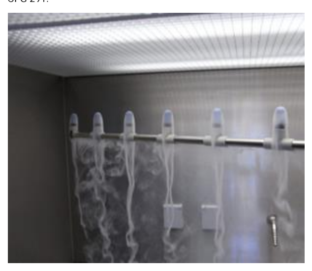
Discharge of the fog with the help of the CFG 291 distribution rake.

The generated fog is highly visible and has a sufficiently high durability to allow photo or video documentation of the air flow.