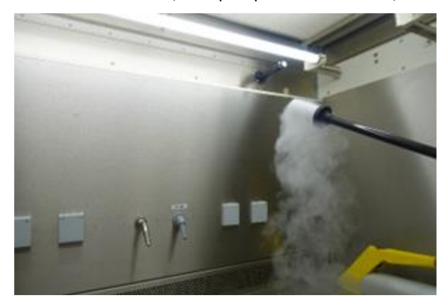
Discharge of the fog with the help of the one spot probe of CFG 291

The fog of the CFG 291 can be released either via the outflow probe (simple, punctual release) or via a distribution rake (multiple, punctual release).