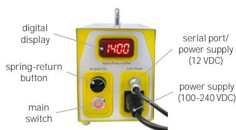
Operation and display elements of ATM 228.