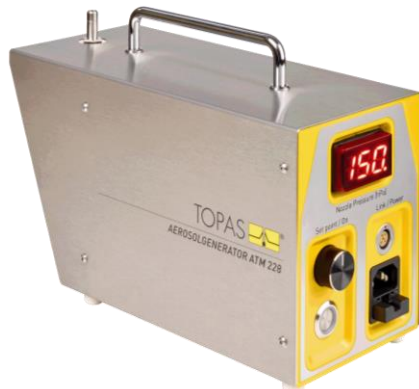
Aerosol generator ATM 228 with internal compressor and differential nozzle pressure control.

The aerosol generator ATM 228 is a further development of the aerosol generator ATM 226 and serves for the mobile generation of test and calibration aerosols from pure liquids, solutions and suspensions. The generator complies to all requirements of VDI 3491-2.